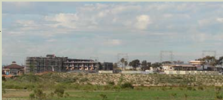
Marina Gateway Project in Progress

The project will include the full service hotel and Buster's Restaurant (well-known from its Seaport Village location) in addition to a 16,000 square foot retail center. Seventy-five to 100 jobs will be cre-