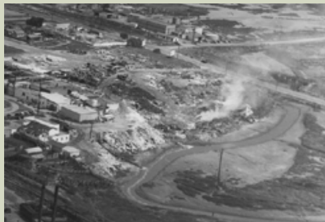
Before Marina Gateway Project

A longtime dream of the City's will become reality this summer when the 173-room Marina Gateway hotel opens in July on Bay Marina Drive at Interstate 5. The 15-year project is the result of extraordinary efforts by a wide team of participants including the National City Community Development Commission ("CDC"), California Integrated Waste Management Board, Sycuan Band of the Kumeyaay Nation, US Fish and Wildlife Service, the Port of San Diego and developer MRW Group.